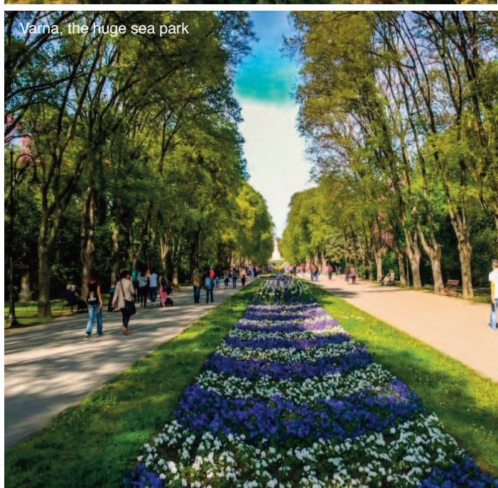
Varna, the huge sea park