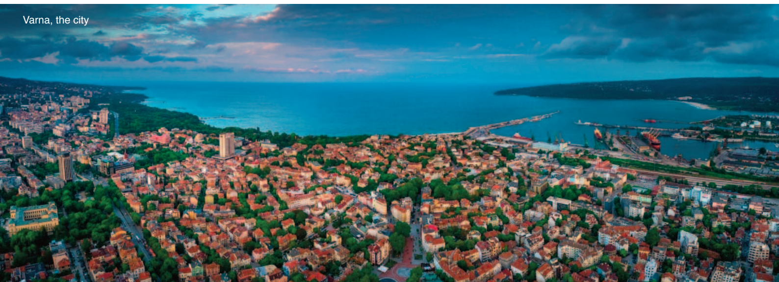
Varna, the city

The oldest gold treasure in the world, belonging to the Varna culture, was discovered in the Varna Necropolis and dates to 4200–4600 BC. City landmarks include the Varna Archaeological Museum, exhibiting the Gold of Varna, the Roman Baths, the Battle of Varna Park Museum, the Naval Museum in the Italianate Villa Assareto displaying the museum ship Drazki torpedo boat, the Museum of Ethnography in an Ottoman-period