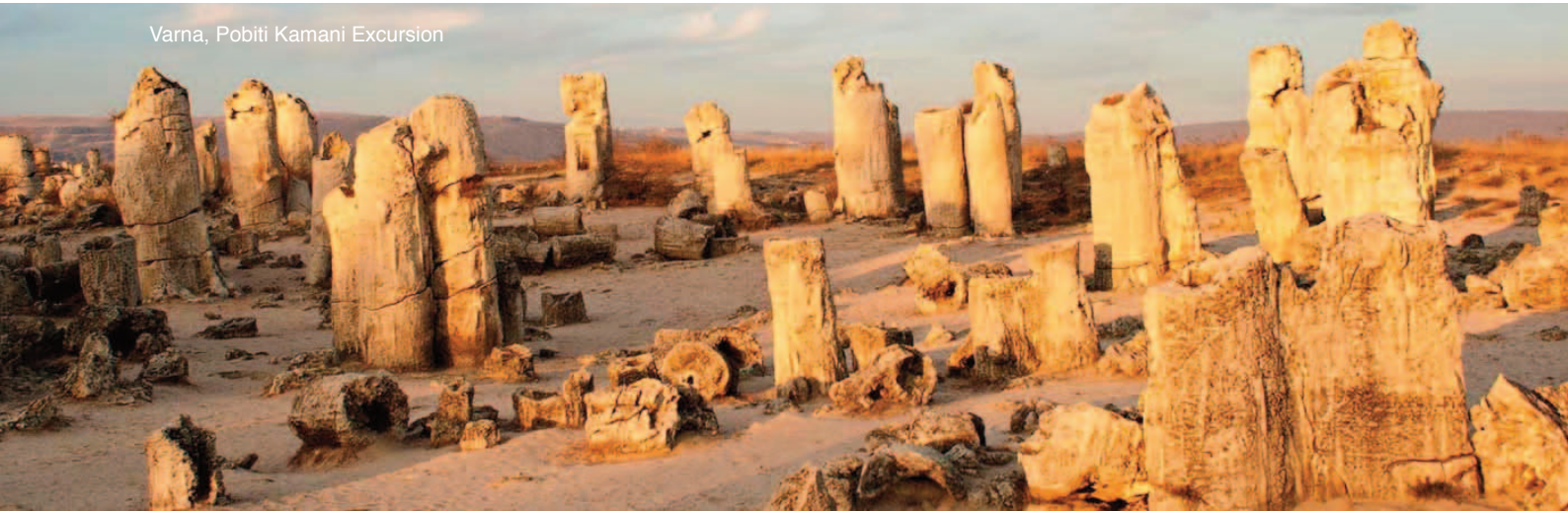
Varna, Pobiti Kamani Excursion

FREE EXCURSION. Pobiti Kamani also known as The Stone Desert , is a desert-like rock phenomenon located on the north west Varna. It is considered the only desert in Bulgaria and one of few found in Europe. The desert consists of sand dunes and several groups of natural rock formations on a total area of 13 km 2 . The formations are mainly stone columns between 5 and 7 meters high and from 0.3 to 3 meters thick. The columns do not have solid foundations, but are instead hollow and filled with sand, and look as if they were stuck into the surrounding sand, which gives the phenomenon its name.