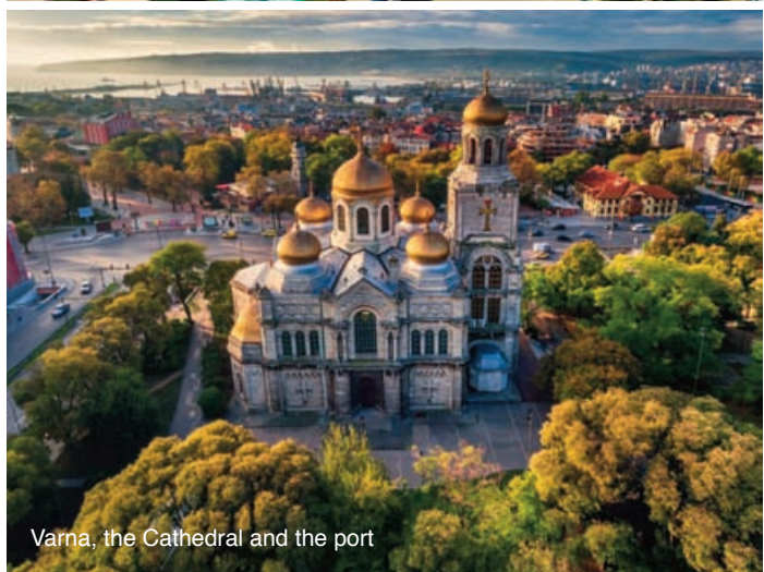
Varna, the Cathedral and the port