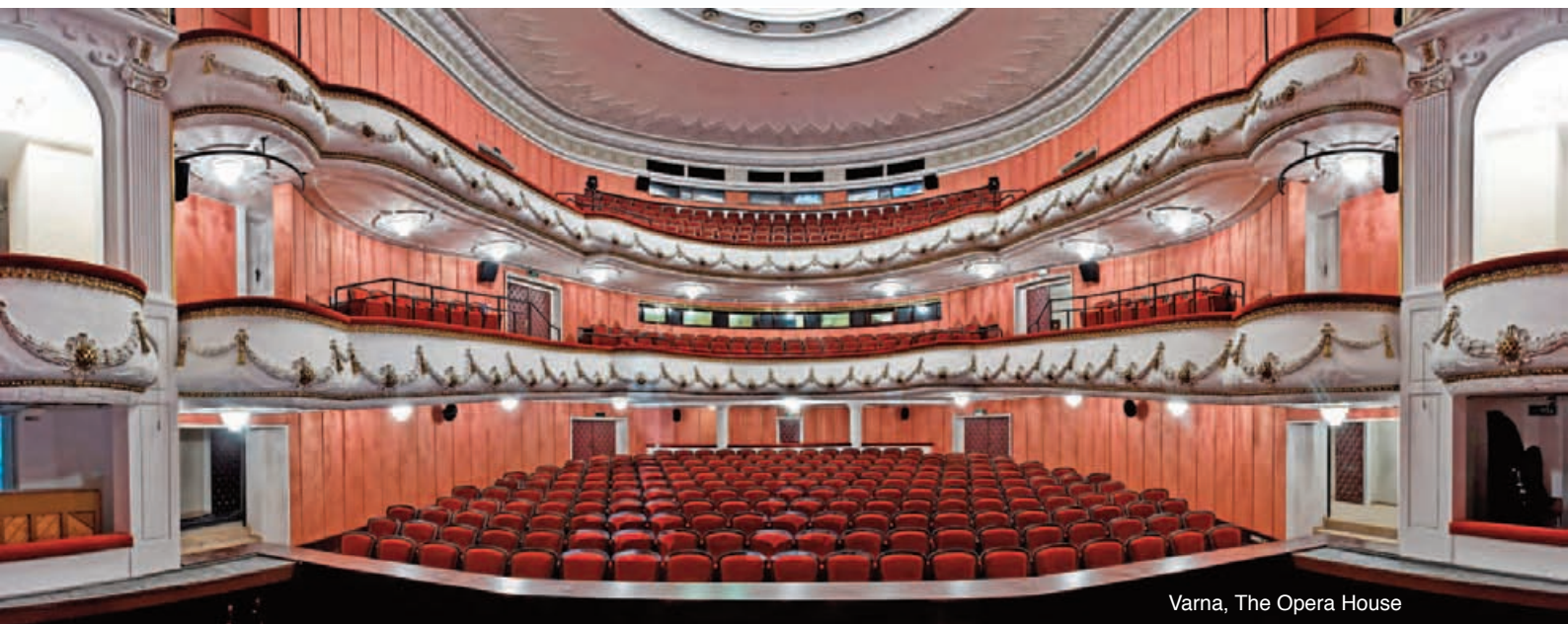
Varna, The Opera House