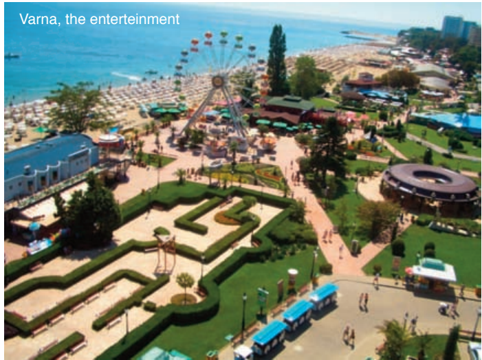
Varna, the entertainment

The city beaches, also known as sea baths (морски бани), are dotted with hot (up to 55°C/131 °F) sulphuric mineral water sources (used for spas, swimming pools and public showers) and punctured by small sheltered marinas. Additionally, the 2.05 km (1.27 mi) long, 52 m (171 ft) high Asparuhov most bridge is a popular spot for bungee jum-