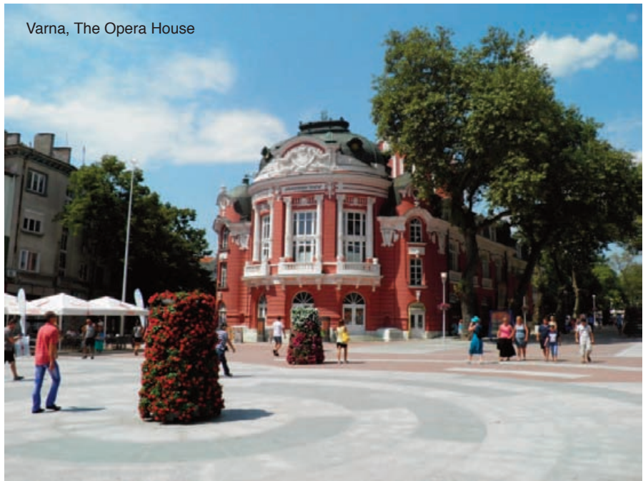
Varna, The Opera House

Food markets, among others, include supermarket chains Billa, Kaufland, Metro and Lidl. In stores and restaurants, credit cards are normally accepted. There is a number of farmers markets offering fresh local produce.